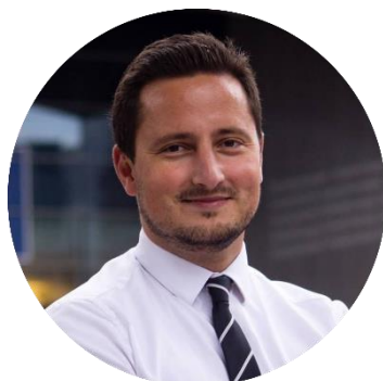
Mr Nicolae Ștefănuță Member of the European Parliament – Group of the Greens / European Free Alliance Romania

Mr Ștefănuță is a full member of the Committee on Budgets, the Subcommittee on Public Health, and the Delegation for relations with the United States. He is also a Substitute member of the ENVI Committee and the Delegation to the EU-Moldova Parliamentary Association Committee. He is dedicated to positive change in the lives of European citizens with multiple roles in the EP — including lead rapporteur on the budget of the European Union for 2023 — and actively involved in promoting health, protecting the environment, and fighting climate change. His studies in economics and international relations at Georgetown University and the Diplomatic Academy of Vienna, as well as over 16 years of experience in European institutions, help him meet the challenges of today's world.